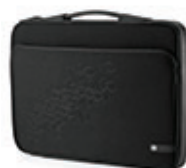
HP Black Cherry Notebook Sleeve - 43,9 cm (17.3") LR378AA