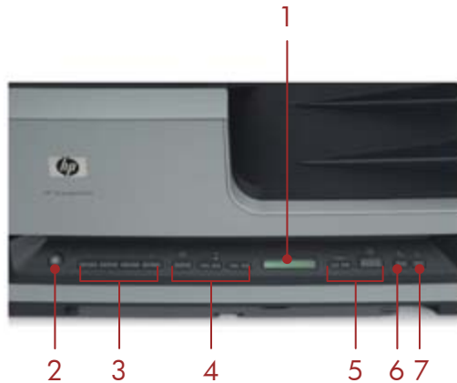
HP Scanjet 8390 shown