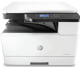
HP LaserJet MFP M436n