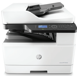
HP LaserJet MFP M436nda

Count on reliable, affordable A3 MFP productivity to expand potential. Simplify workflows with efficient scan solutions and copying, and get networking plus remote monitoring. 1 Save resources and time with automatic paper-handling features. 2,3